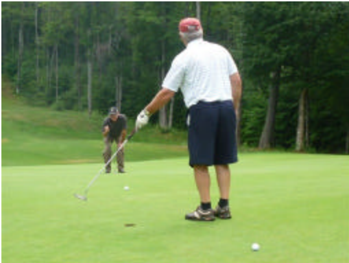
Its on the way, but did he make it?