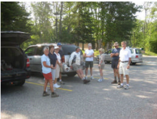
At the beginning, well rested