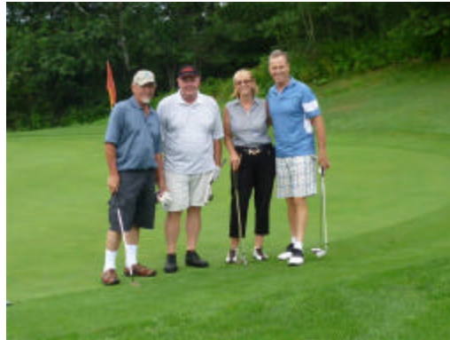
Happy to finish