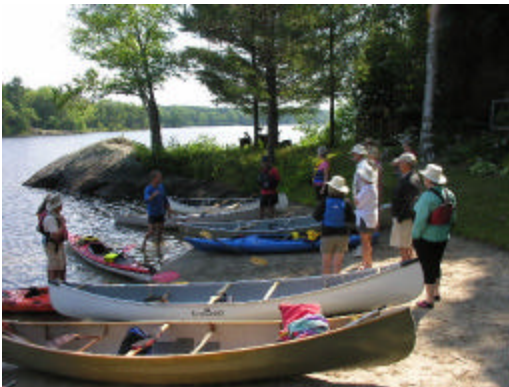
Pre-paddle talk, avoid the white sharks, sea snakes And the alligators