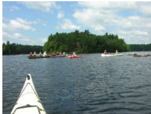
and the rocks!