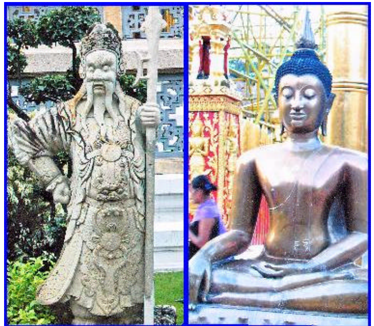
- THE WONDERS OF TAIWAN-