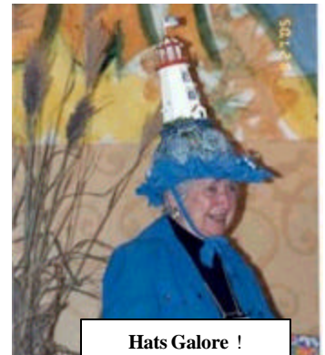
Hats Galore !