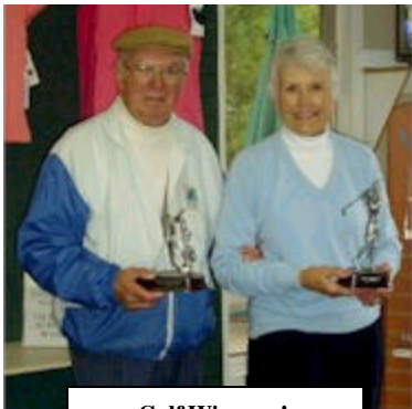
Golf Winners !

Did the attendees at "Rendezvous 2005" have a good time ? Perhaps we should just let the photos speak for themselves. We can't share the memories with you but perhaps those who did attend will gladly do so !