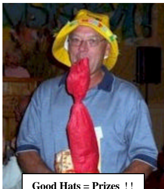
Good Hats = Prizes !!