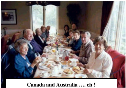
Canada and Australia .... eh !