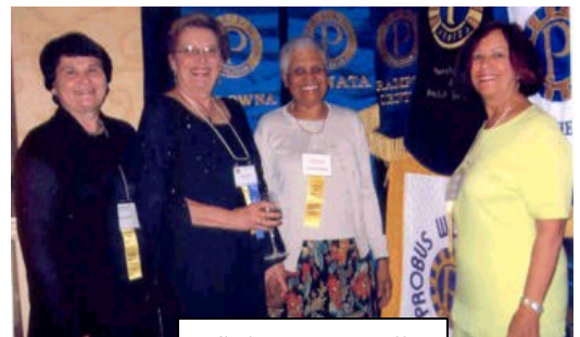
Smiles all around !!