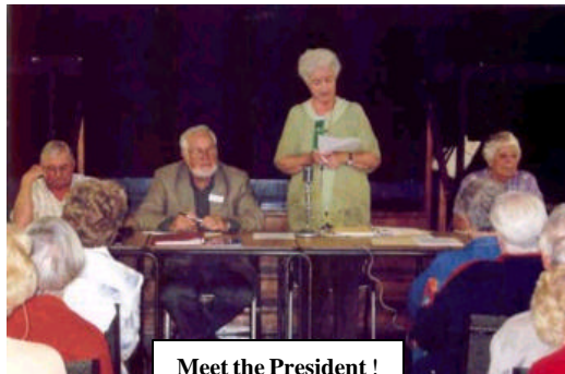
Meet the President !