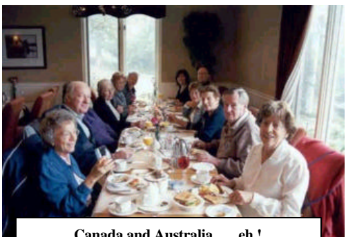
Canada and Australia .... eh !