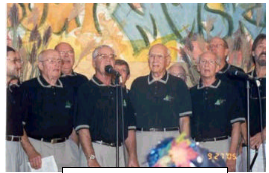
And The Singing Was Great !