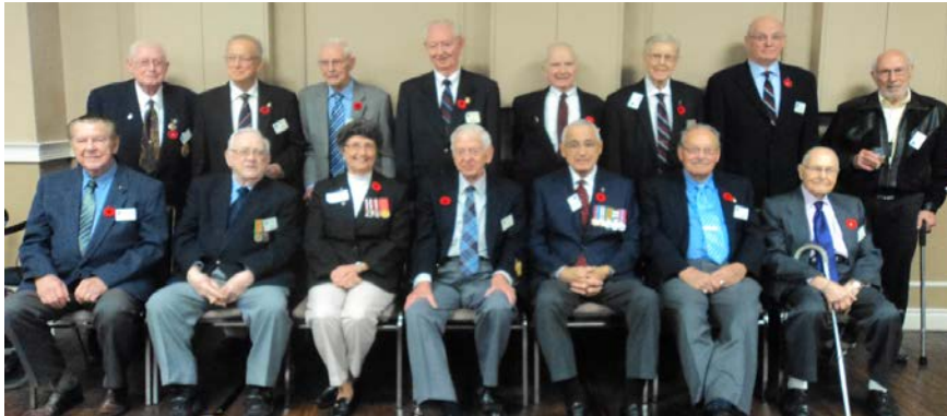
The PROBUS Club of Cambridge #1 hosted their annual Veterans' Luncheon again this year and invited the neighboring Clubs to attend. On behalf of Veterans and their families everywhere “We Salute You Once Again Cambridge” !!